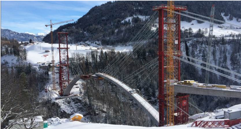
Fig. 1. View from Northwest (on the side of Valens) – arch under construction.