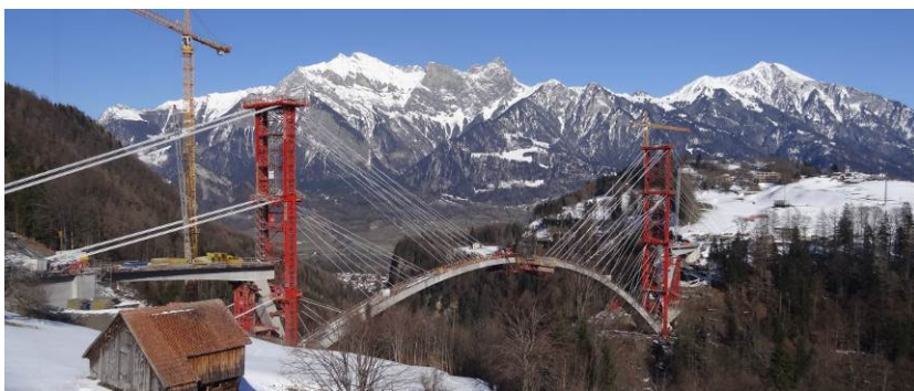
Fig. 3. View from Southwest (on the side of Valens).

In order to safely transfer the backstay cables forces to the underlying rock, 96 ground anchors of type CONA-avt L12 were used (ultimate force 2232 kN per anchor, total length of over 2'000 m). The load transfer from the backstay cables to the ground anchors was achieved by using welded steel transfer beams.