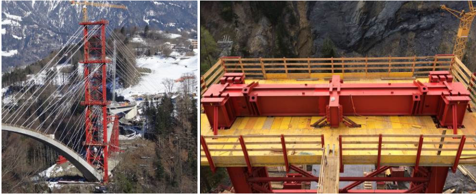
Fig. 5. Pylon and transfer beam.

cables mostly in equilibrium, to minimize the bending moments in the pylons. Unfortunately, keeping this equilibrium is in conflict with a simple tension sequence which would be desirable for a rapid construction progress. In this case, the decision was made to build stronger pylons and to keep the simple tension sequence. Eventually, before finishing the arch, an axial force of 4600 t reached the foundation on the Pfäfers side.