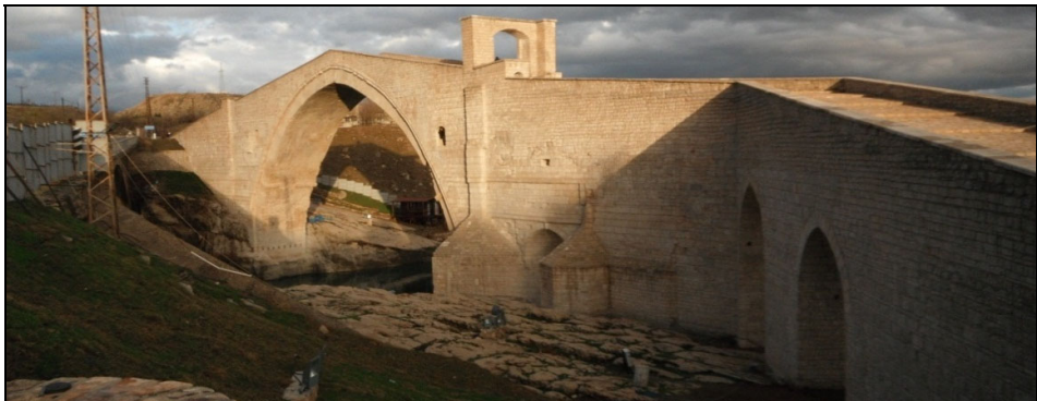
Fig. 4. Post-Restoration view of the bridge.

The bridges the major function of which is to provide accession should first be stabilized in order to allow safe passageway. The restoration works to be carried out on the arch stone bridges which are proven to be durable against the factors such as earthquakes, dams, variable water flows and heavy traffic over the centuries should comply with the original construction techniques, protection of the material wise properties and the “least intervention” principle.