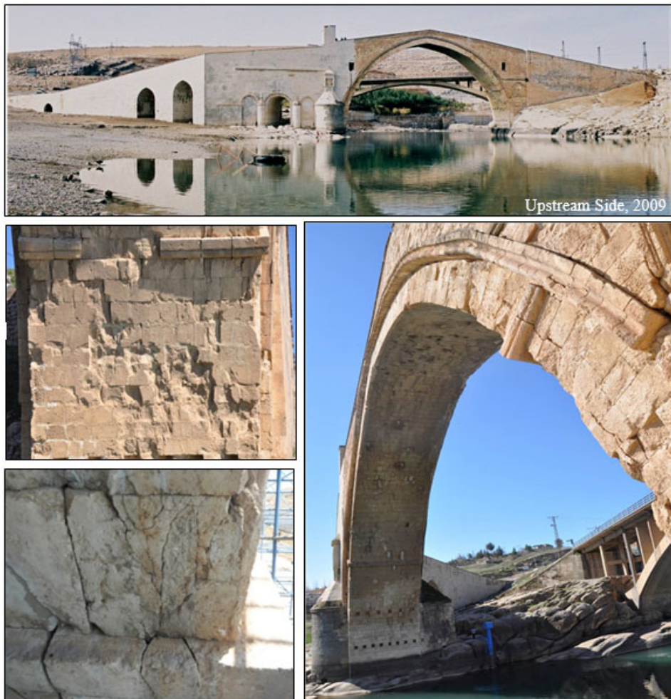
Fig. 2. Pre-restoration view of the bridge.

Malabadi Bridge which provides a passageway for the road on which it is located for centuries has survived to date without any substantial structural damage. However, during repair works carried in 1954 and 1985, the surfaces were plastered by cement base mortar other than the surfaces on the intrados and spandrels of the main arch while the bridge was paved with concrete. In order to prevent the gradually increasing disfiguration of the stones due to the effects of the variable water flow from the nearby dam and clear the traces of the repairs made most lately and which have been deemed not to be in harmony with the original pattern of the bridge, the bridge was included in the program in 2009 [6], (Fig. 2).